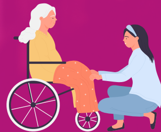
Long term care