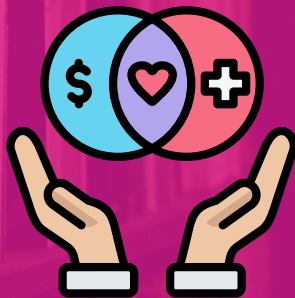
Quality of Life